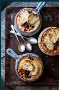
Corn & Lobster French Onion Chowder