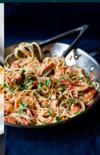
Lobster meat pasta