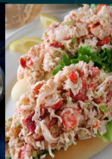
Lobster Salad with Green Onions