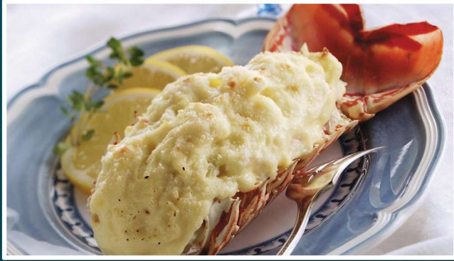
Lobster Thermidor Classic