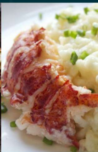
Lemon Risotto with Butter Poached Lobster