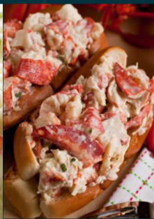
New England Lobster Roll