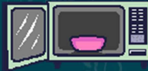
Micro wave resist pack