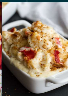
Lobster Nac'n Cheese