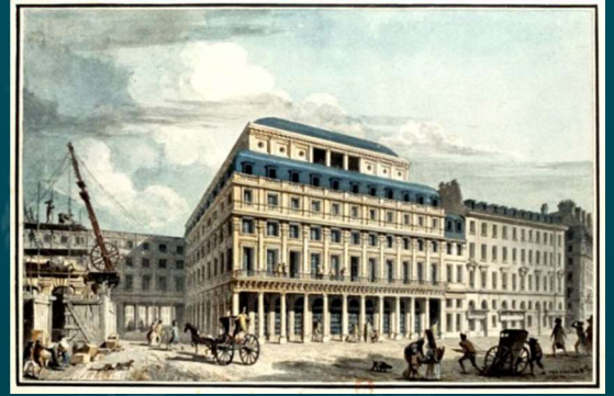
Comédie-Française, late 18th century