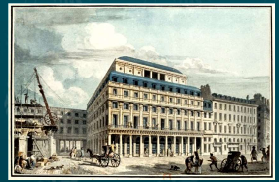
Comédie-Française, late 18th century